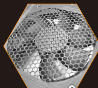
120mm Fluid Dynamic Bearing (FDB) Fans