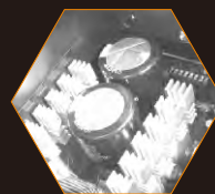
High Quality 105°C E-CAP