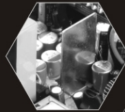
High Quality 105°C E-Cap