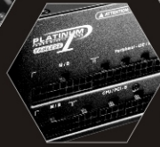
Patented DC connector Module