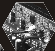
Patented DC connector Module