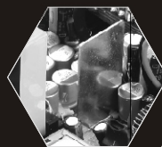
High Quality 105°C E-Cap