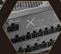
Patented DC connector Module