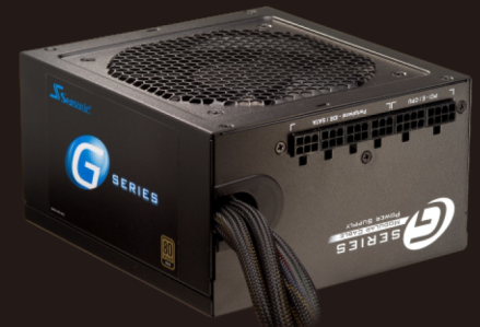
• Detachable Modular Cable: 750/650/550/450W