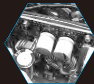
DC to DC Converter Design