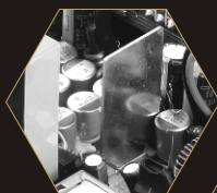
High Quality 105°C E-Cap