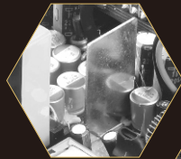
High Quality 105°C Cap