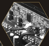
Patented DC connector Module