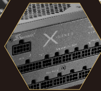
Patented DC connector Module